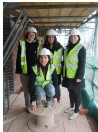
Union Chapel Project Staff helping the work!

The tower and spire will emerge from the scaffolding in the autumn of this year. The architects have been drawing up details of stonework which needs to be recarved—some of which have been worn away completely over the years—like these medallions in the gables.